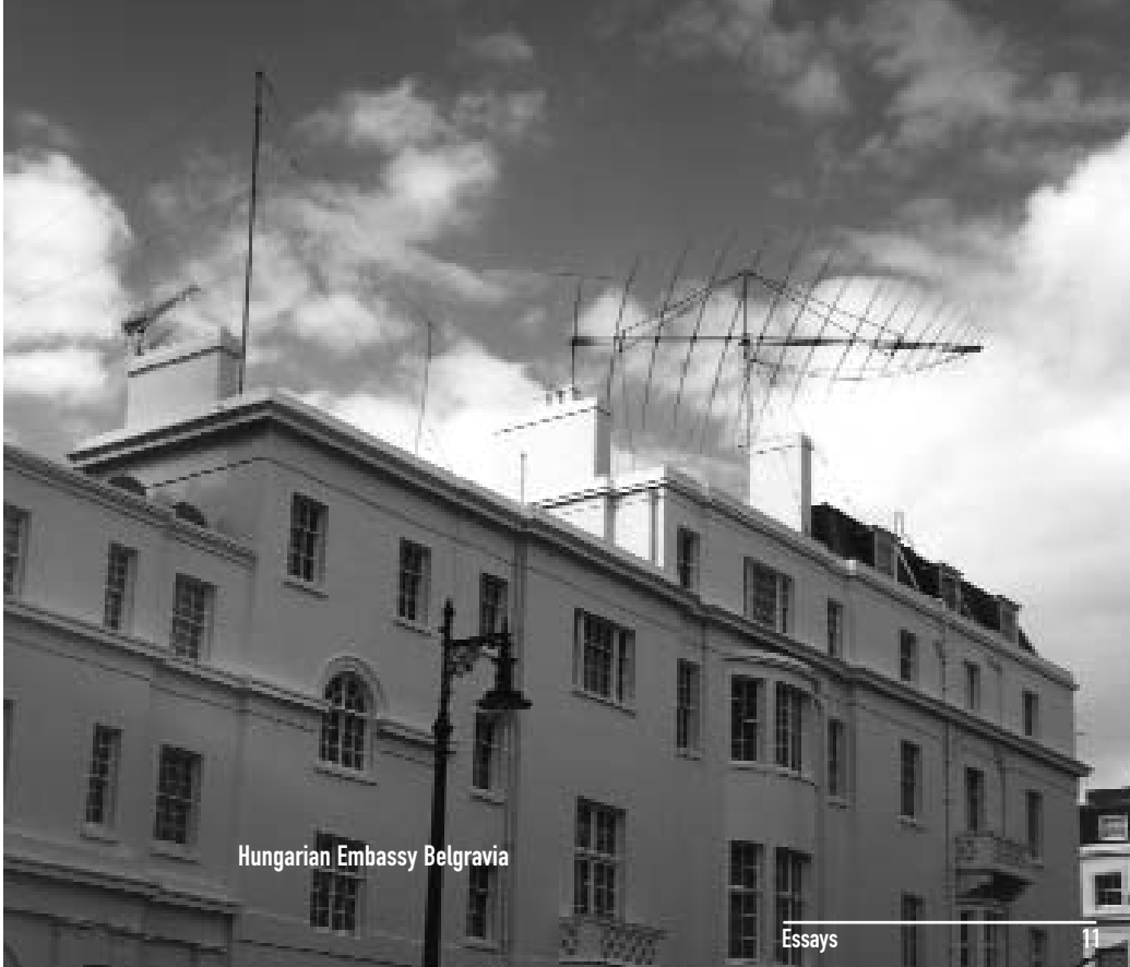
Hungarian Embassy Belgravia